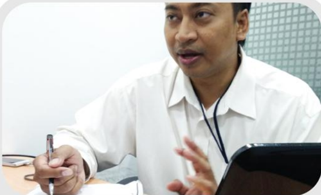
Consultation & Coaching