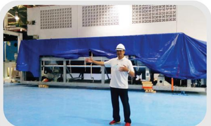
Business Research & Analysis