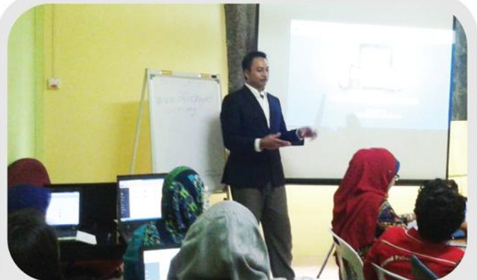
Training, workshop and seminars.